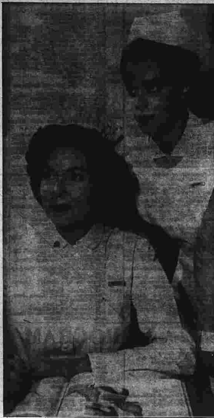
Shirl Conway (left) and Zina Bethune (right) work even longer hours filming "The Nurses" than their real-life counterparts. Miss Conway majored in speech therapy, "almost a pre-med course," at the University of Michigan before going on the stage. Show is seen Thursday nights on CBS-TV.