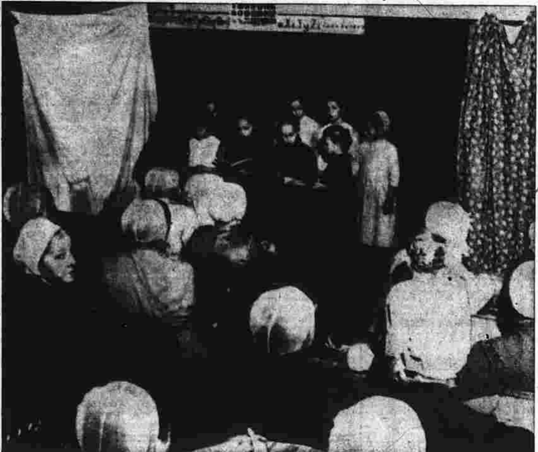
Mobara, wearing the traditional white head cover, listen to their children sing carols at a Christmas program presented at a one-room schoolhouse outside Havana yesterday.